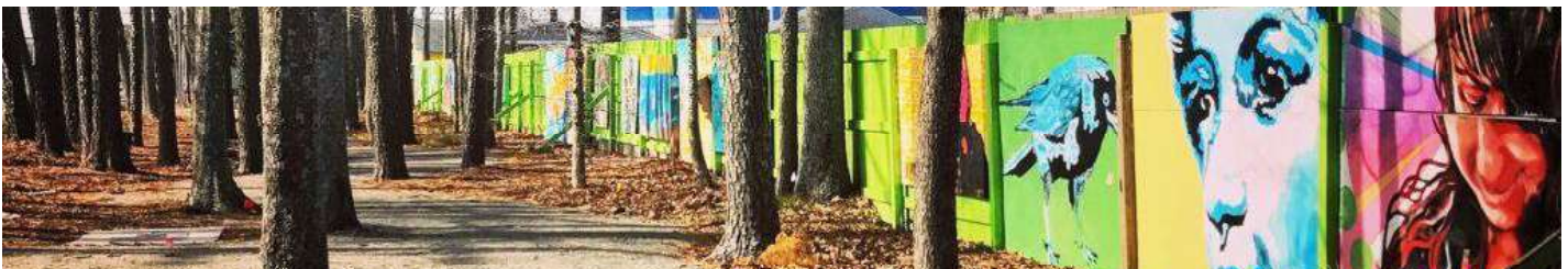
Figure 2. Murals by Local Artists in ViBe Creative District

Why the ViBe Creative District? On April 21, 2015, the City of Virginia Beach established the boundary of the ViBe Creative District by ordinance and declared it “an arts and cultural district and technology zone” with incentives established by the Virginia General Assembly. The ViBe’s purpose is to serve as a vibrant center for the arts, culture, and technology, and to support artists, technical, and creative businesses to help them flourish and cross-pollinate. The ViBe is a work/live area of the city not far from the oceanfront where creative and young business owners have built a thriving venue for artistic and progressive endeavors. Residents of the ViBe District appreciate the nearby oceanfront of Virginia Beach and acknowledge the opportunities of sustainable living and sustainable business practices which is why Zero Energy Ready Homes are the perfect fit for the the ViBe Creative District.