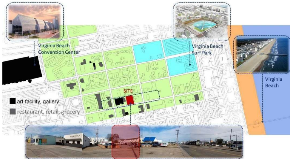
Figure 3. Market Growth Potentials for Millennials and Artists

In order to make this project feasible, the Net Zero Container homes need to be market rate and cater to the needs of our stakeholders. Building in this area will allow the residents of the container village to have access to all of the amenities the ViBe district has to offer, from farm-to-table restaurants and the Virginia Beach Oceanfront to art studios and business incubators. As of the writing of this report, city officials are discussing a proposal to create a surf park resort within a 5 to 10 minute walk from our site.